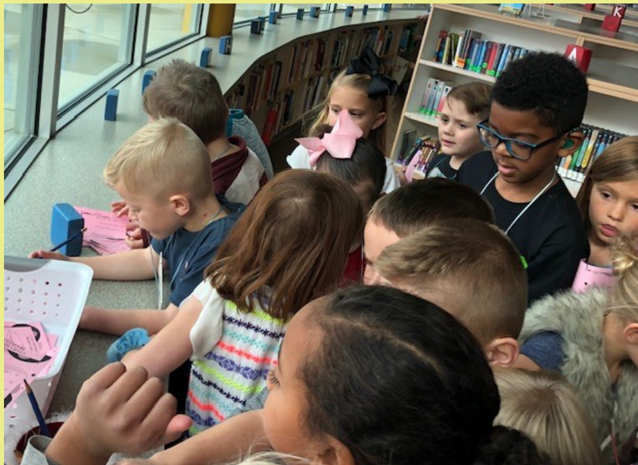
Critiquing and then voting for award books in library