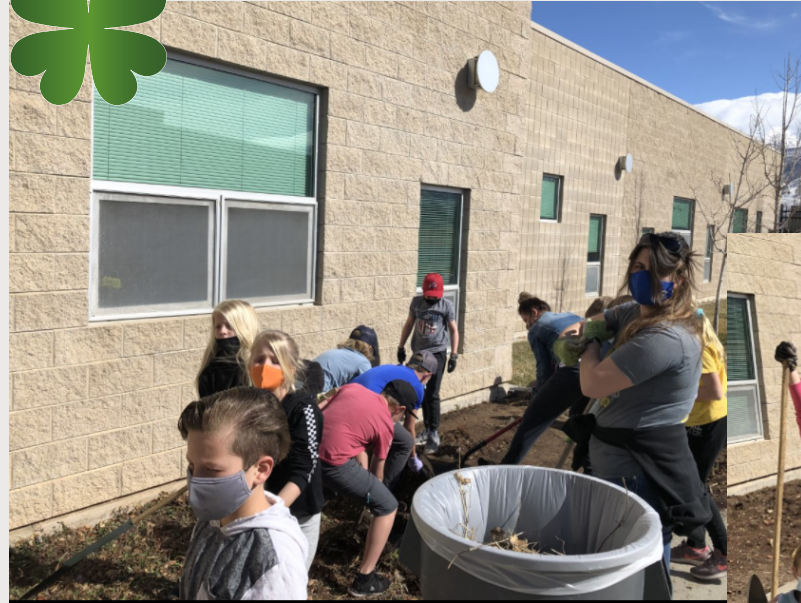
Fifth Grade Planter Box Project